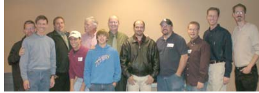
Men who participated in the October 2006 Training

velop a support system as they gain information and techniques for parenting children who have already had difficult life