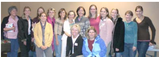
Ladies who participated in the October 2006 Training

At Kingdom Kids Adoption Ministries we realize that adoption has become rather "trendy" in Christian circles. Many people have the desire to "rescue an orphan" but are unprepared for the issues and challenges they may face. We have felt the Lord leading us away from our former emphasis on encouraging fami-